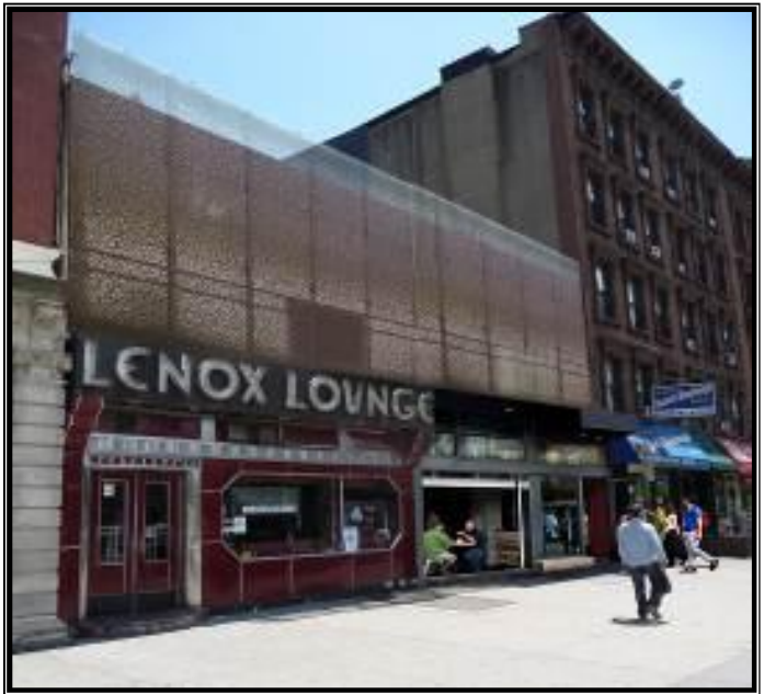
As Two Stores